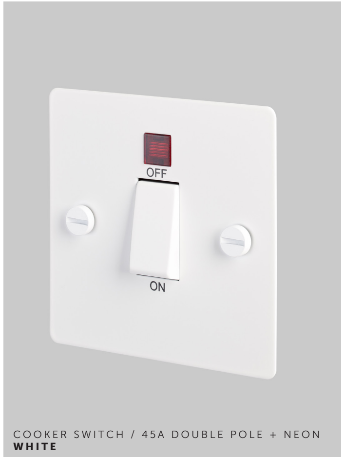
COOKER SWITCH / 45A DOUBLE POLE + NEON WHITE