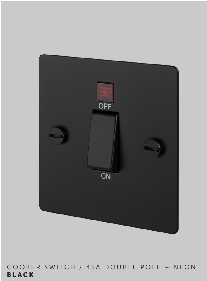
COOKER SWITCH / 45A DOUBLE POLE + NEON BLACK