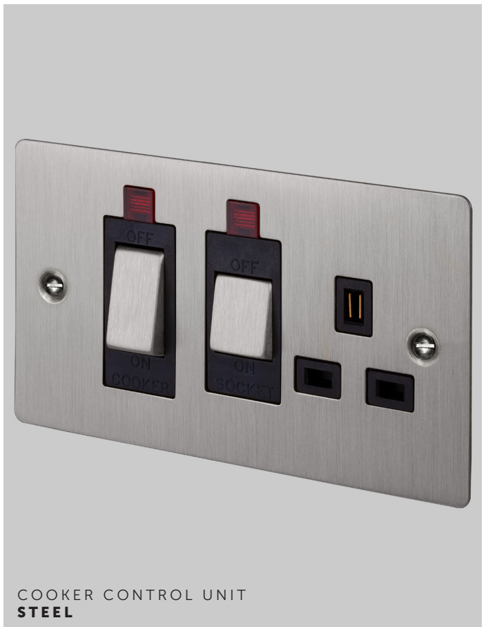
COOKER CONTROL UNIT STEEL