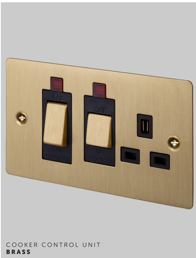
COOKER CONTROL UNIT BRASS