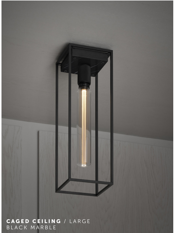
CAGED CEILING / LARGE BLACK MARBLE