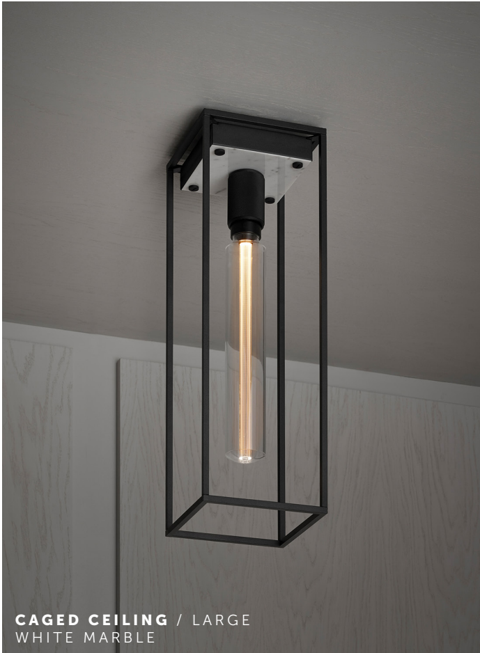
CAGED CEILING / LARGE WHITE MARBLE